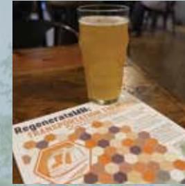
RegenerateMN Transportation Trending Panel