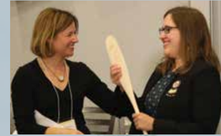
Legislative Awards Reception

MCEA brings people together across Minnesota around big ideas that are driving change. From Ely to St. Paul, hundreds of people attended our events in 2017.