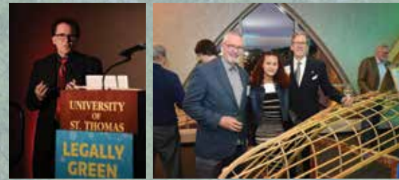
Legally Green Gala: Stand Up for Science