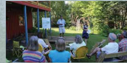
Northern Minnesota Conversations