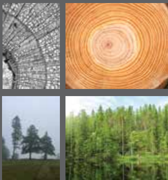
Minnesota State Tree // Red Pine

Defending clean water, driving a change to clean renewable energy, and protecting our most precious places isn't easy. Real environmental progress takes time, dedication, the search for truth, and the commitment to follow wherever that search leads you. The Minnesota Center for Environmental Advocacy has been on this journey since 1974.